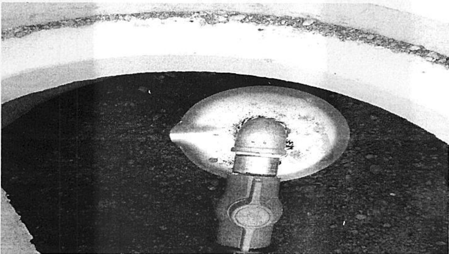
5mm borehole sleeve