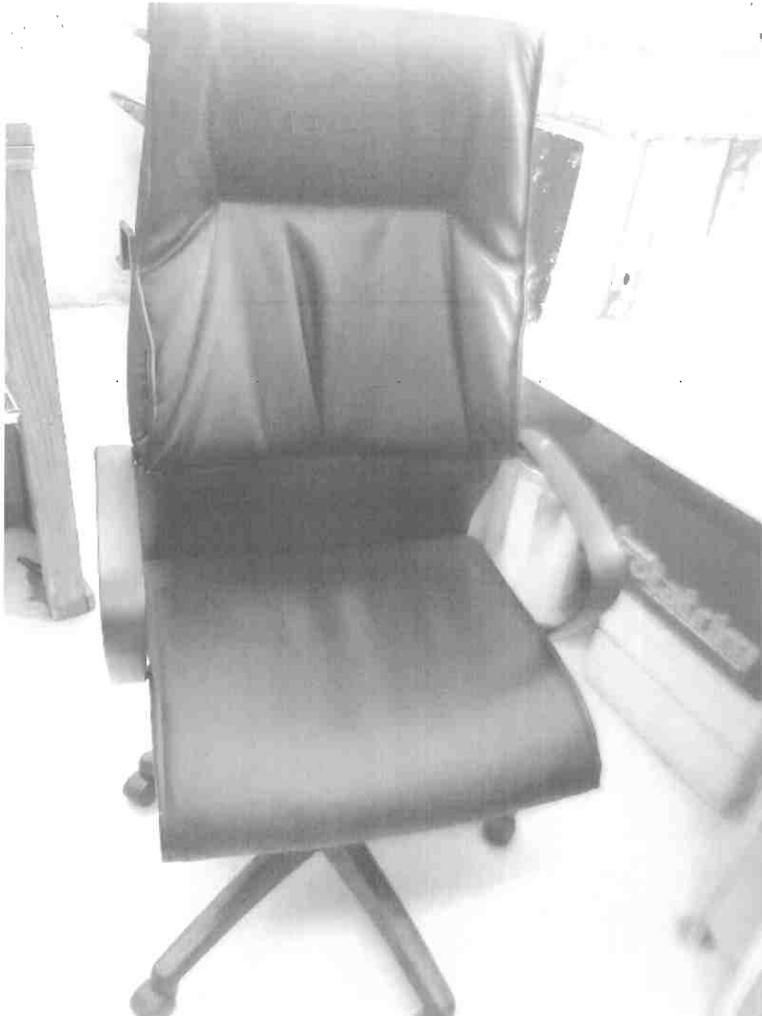
ITEM NO 07