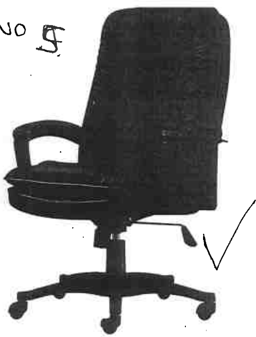
Loreen Highback Leather Touch