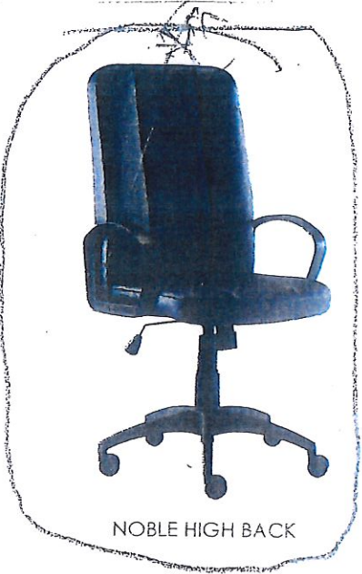
NOBLE HIGH BACK