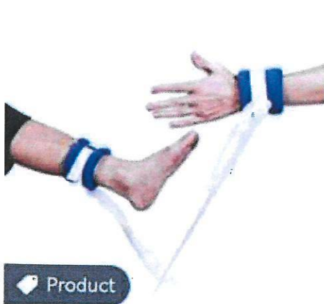
Exttlliy 4PCS Hospital Patie... pricecheck.co.za