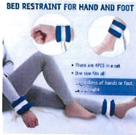
Buy Exttlliy 4Pcs Hospital P... ubuy.com