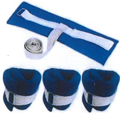
Ibnotuiy 4Pcs Medical Restr... importitall.co.za