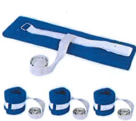
Ibnotuiy 4Pcs Medical Restr... wantitall.co.za