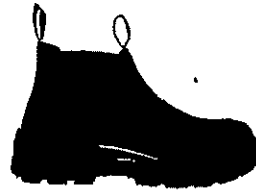
Premier Chelsea Black