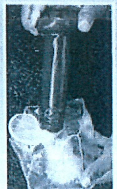
...and showing what to avoid