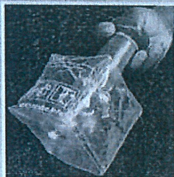
"Ejaculation" inside the O-Cube