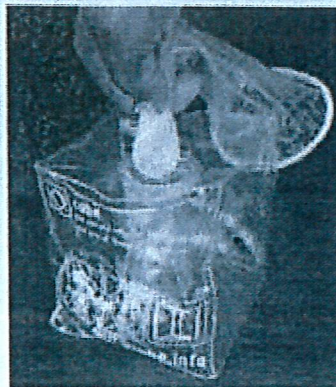
Inserting a female condom