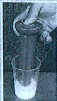
Preparation: Filling the E-Shaft with synthetic cream (or water)