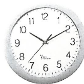
R 266,40 Basetech 1556546 Ra... (94)