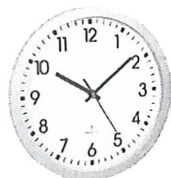
R 366,36 TFA Dostmann 60.352... (71)