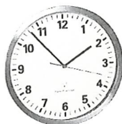
R 682,91 TFA Dostmann, 60.35... (33)