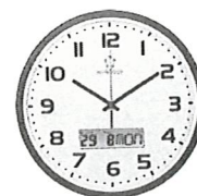
R 616,27 Renkforce HD-WRCL1... (75)