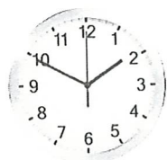
R 416,34 Tfa Dostmann 981.091... (95)