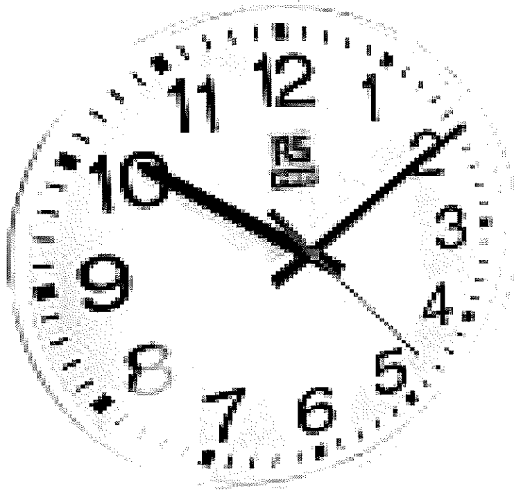
Analogue clock with numbers around outside the face with hour and minute hands used to tell time