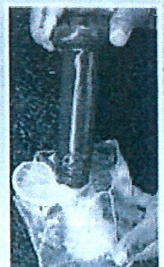
...and showing what to avoid