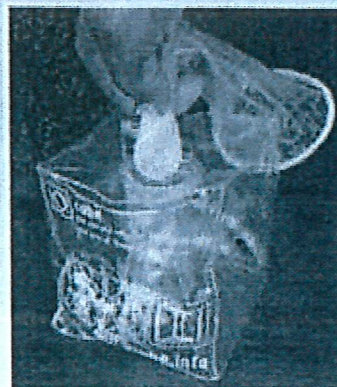
Inserting a female condom