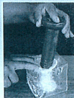
Guiding the penis in correctly...