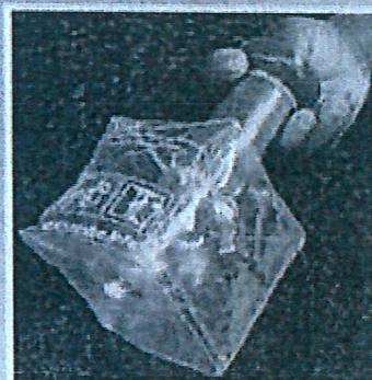
"Ejaculation" inside the O-Cube