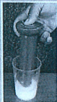
Preparation: Filling the E-Shaft with synthetic cream (or water)