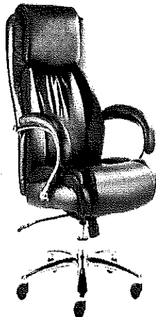
HEAVY DUTY SWIVEL & TILT MECHANISM