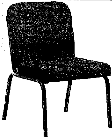
VISITOR OFFICE CHAIR

Economy Side Chair – No Arms - 87 x 55 x 64 cm Colour Black