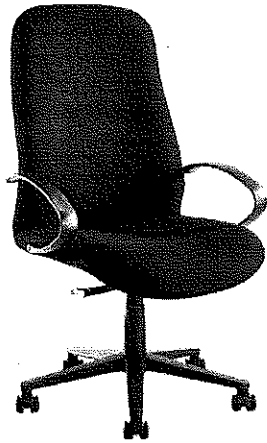
HIGH BACK SWIVEL CHAIR