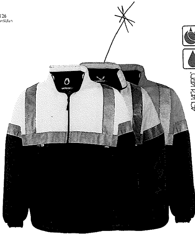
WATER DEFENDER TWO TONE REFLECTIVE HIGH VIZ FLEECE JACKET