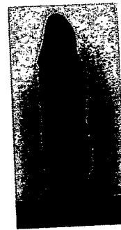
Large area of HIV-susceptible inner foreskin exposed