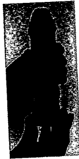
Retracting the foreskin