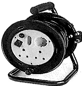
Extension Reel 1m x 15m