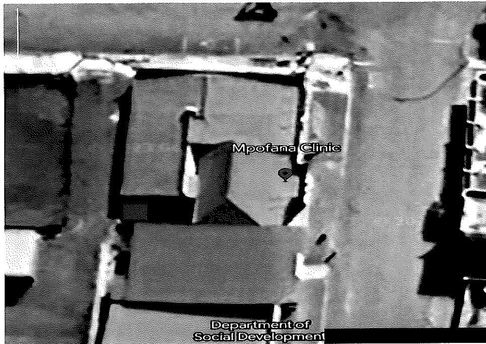
Figure 1: Generator Position in Red

Tenderers are advised to acquaint themselves with the site conditions including access, as no claim on the grounds of want of knowledge will be entertained.