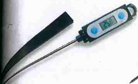
THE0001 THERMOMETER ELECTRONIC (-50°C to +200°C) WATER RESISTANT THERMOMETER