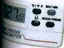
THE0004 THERMOMETER DIGITAL FRIDGE/FREEZER (-20°C to +70°C) FRIDGE/FREEZER THERMOMETER