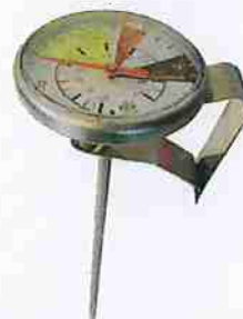
THE0008 THERMOMETER COFFEE 125mm (50°C to 100°C) COFFEE, CAPPUCCINO, MILK THERMOMETER