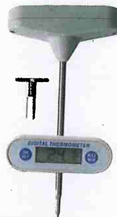
THE0003 THERMOMETER DIGITAL T-BAR (-50°C + 200°C) STRONG PROBE THERMOMETER