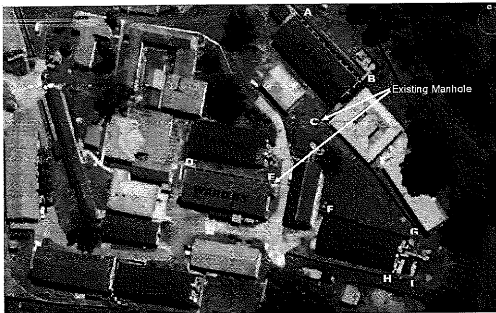
Richmond Hospital - Wards Affected By Sewer Blockages