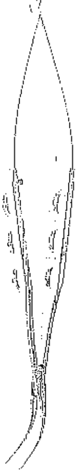
Shepard Lens Holding Forceps duckbill shaped jaws slightly curved K5-8600