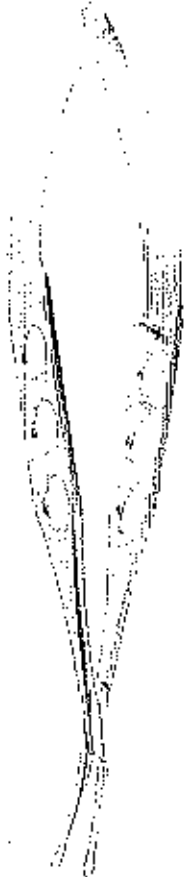
KAMRA™ Inlay Forceps very thin, highly polished paddle-shaped jaws for use in picking up and placing the Kamra™ implant. K5-8510