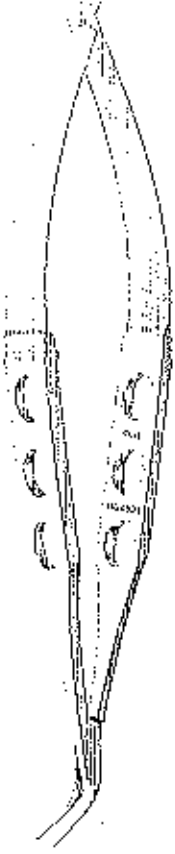
Blaydes Lens Holding Forceps very delicate narrow jaws angled 45° K5-8500