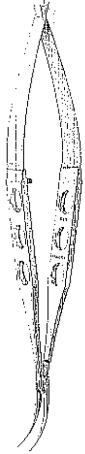
Kratz Lens Holding Forceps very delicate narrow jaws curved K5-8480