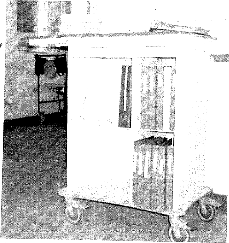
SAMPLE OF : METAL DOCTORS ROUND TROLLEY FOR MDR TB UNIT