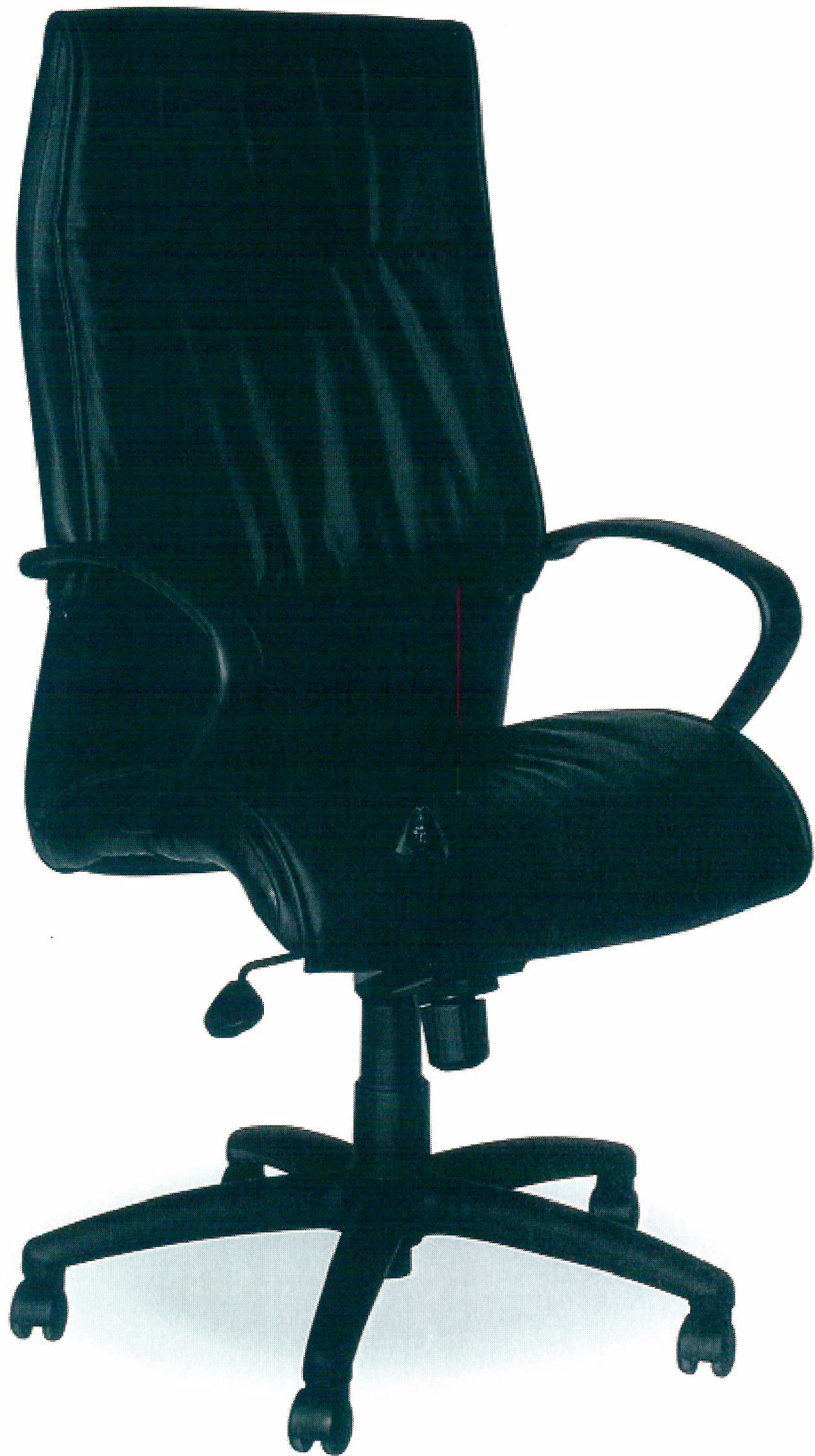
HIGHBACK LEATHER SWIVEL CHAIR