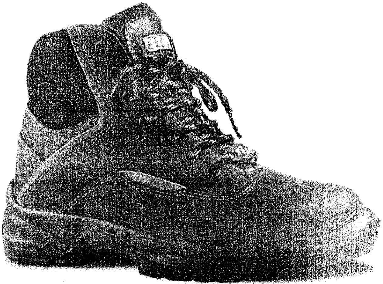
Sisi Black Reese Ladies Black Boot