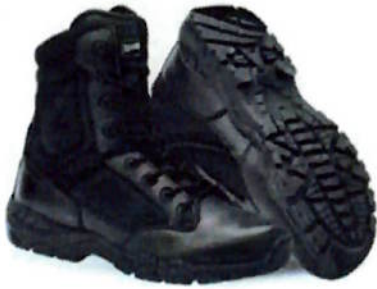
VIPER PRO 8" SZ CT WIDE