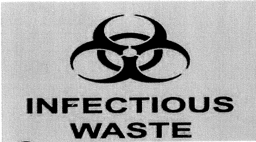
Labelling sticker for red bin