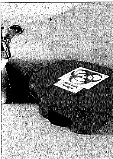
Sample of a heavy duty bin