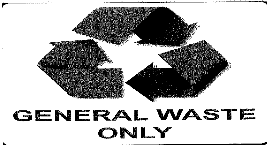
Labelling sticker for white bin