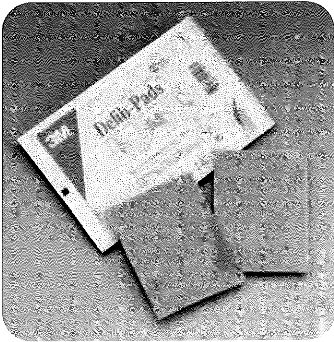
3M™ Defib Pads 2346N , 114 m...