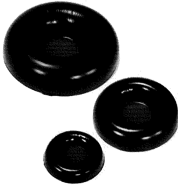
Flat gel pad