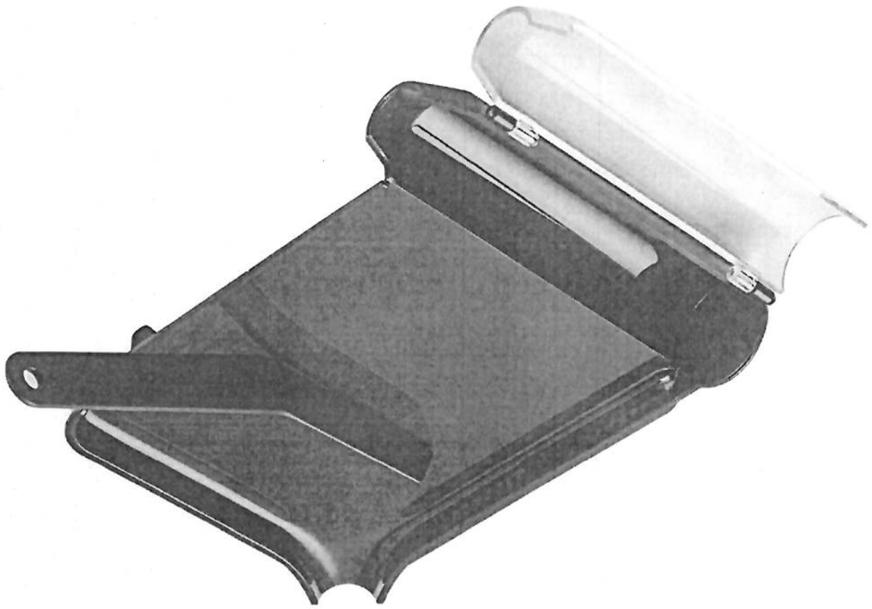
Pill/ Tablet counting tray with spatula