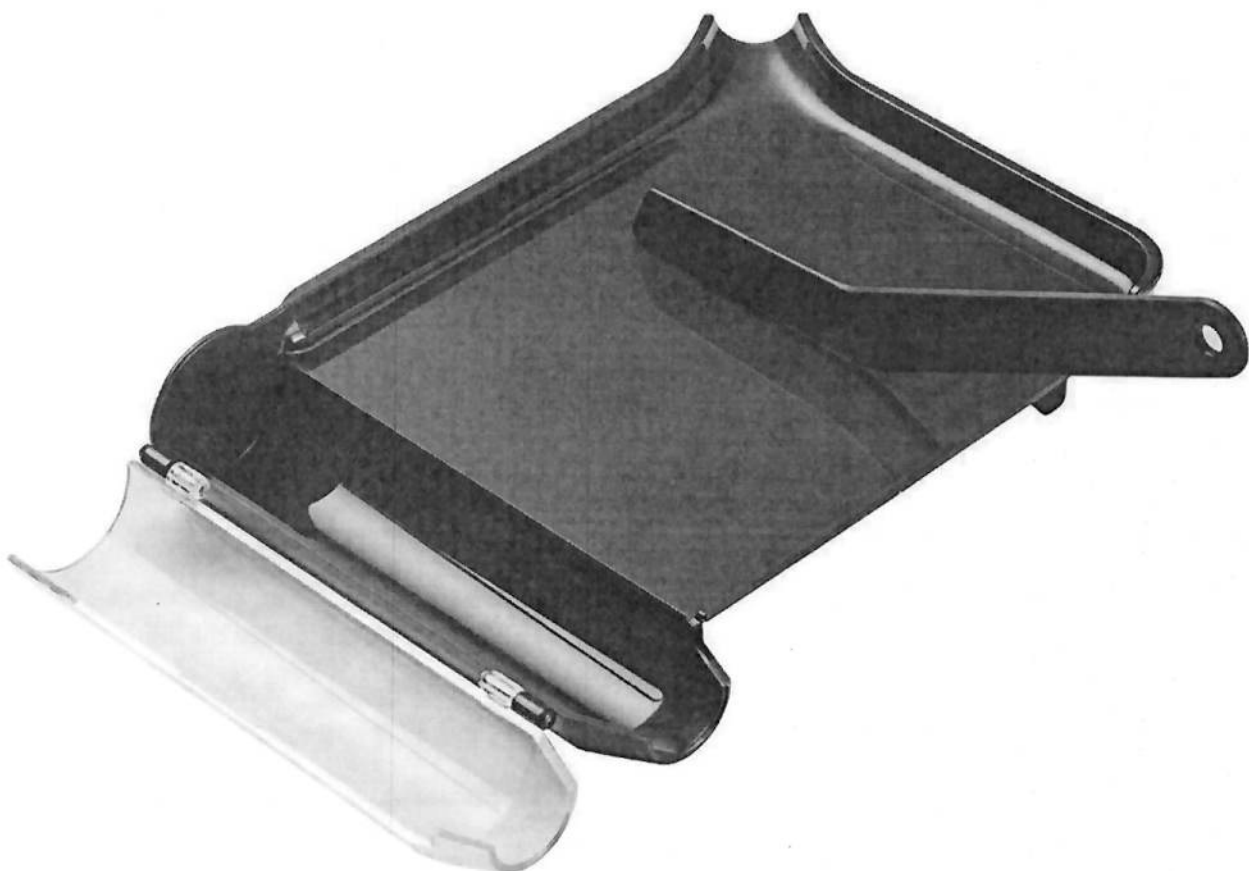
Pill/ Tablet counting tray with spatula