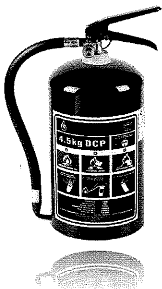
4,5 kg dcp