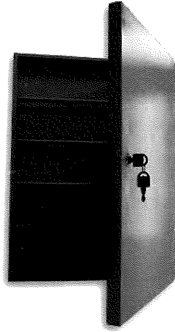
Steel key cabinet