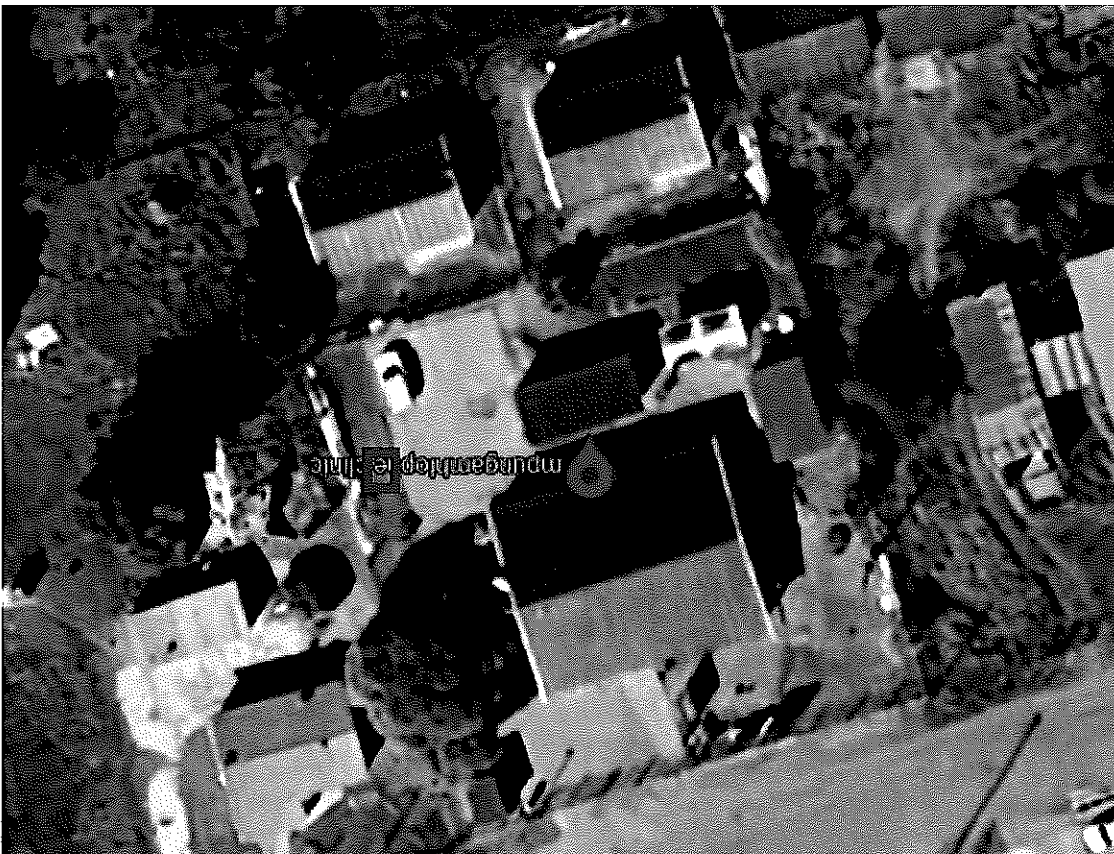
Figure 1: Generator Position in Red

Tenderers are advised to acquaint themselves with the site conditions including access, as no claim on the grounds of want of knowledge will be entertained.