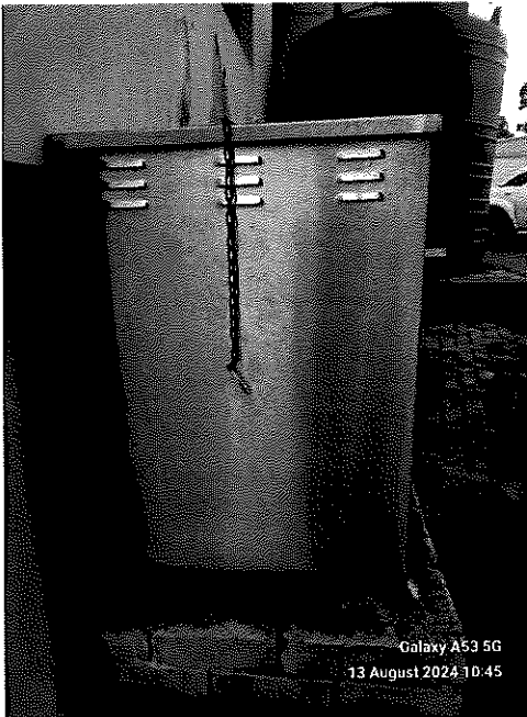
Galaxy A53 5G 13 August 2024 10:45