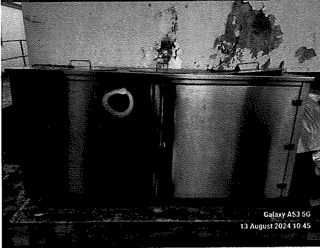
Galaxy A53 5G 13 August 2024 10:45