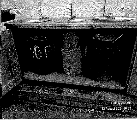
Galaxy A53 5G 13 August 2024 10:53