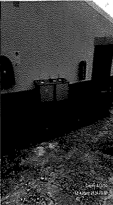
Galaxy A53 5G 13 August 2024 10:46