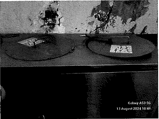
Galaxy A53 5G 13 August 2024 10:46