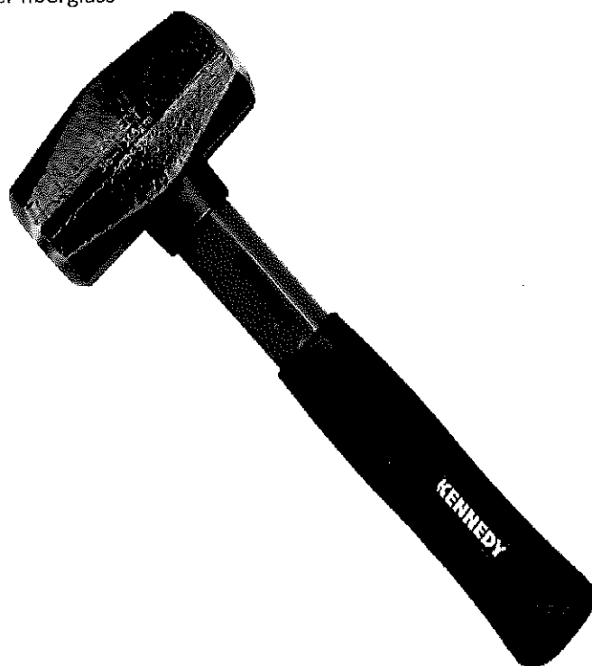
Shaft 1,1kg Club hammer fiberglass