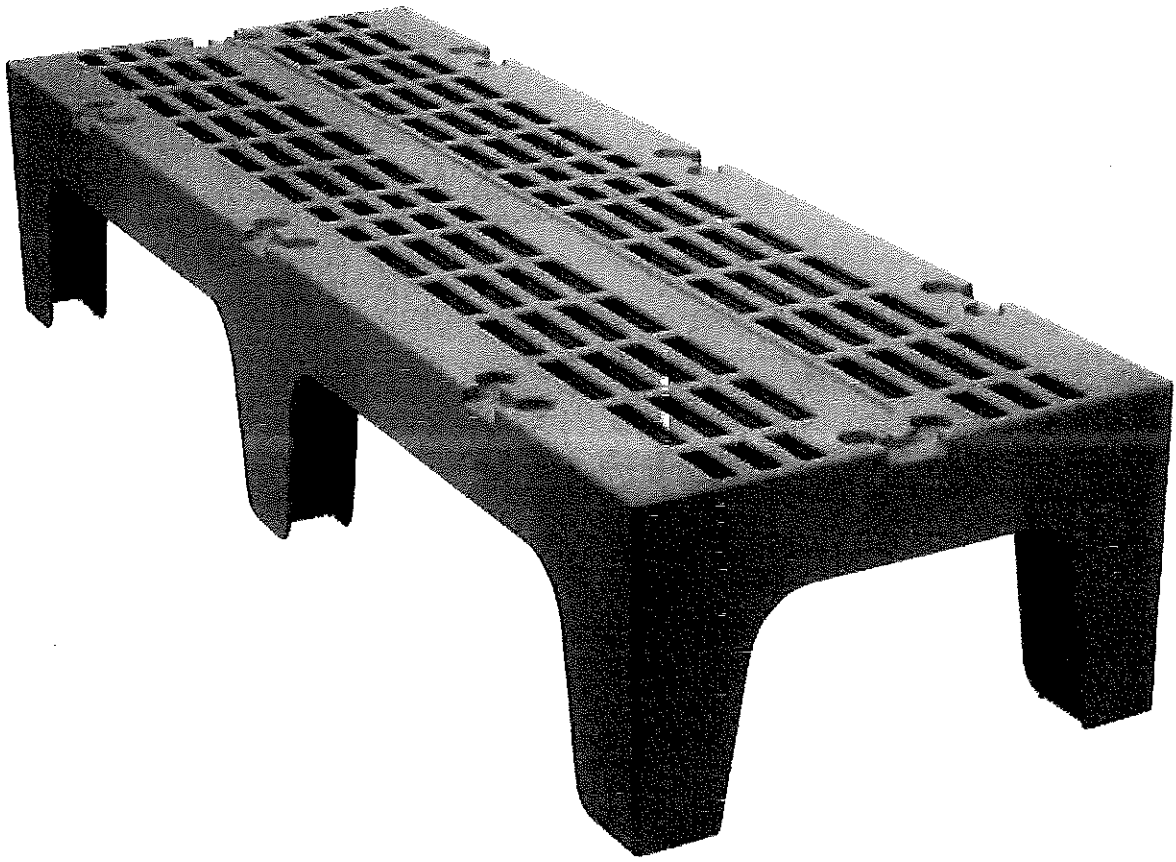
Dunnage Rack Vented 300mm 533mm 915mm L Dunnage Rack