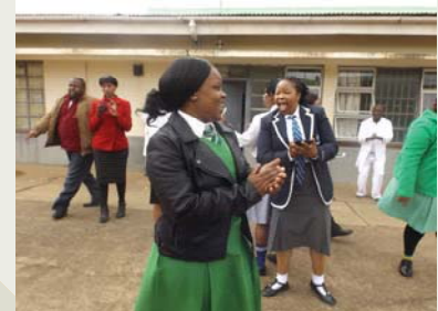
Above: staff members taking some time out enjoying to be like school children again.