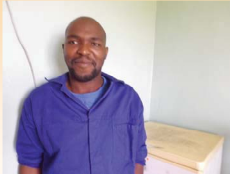
B.P. Sibiya Tradesman Aids