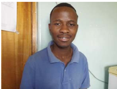
Maphumulo A.M Food services aid