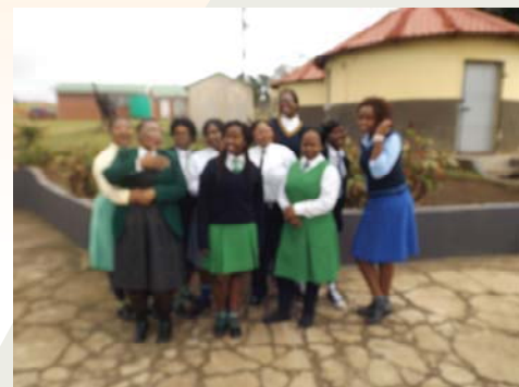
On the left hand side staff members sharing their memories . In between: Staff members embracing our (acting PRO) who made this day successful..