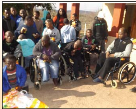
Above: these are the happy faces of Zisize care center they were so pleased to see us spending time with them. They felt like human beings because sometimes they felt abounded by families.