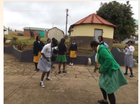
Above: lot of games were played to commemorate this day and to make a memorable event and you c an see, some staff members playing like high school games