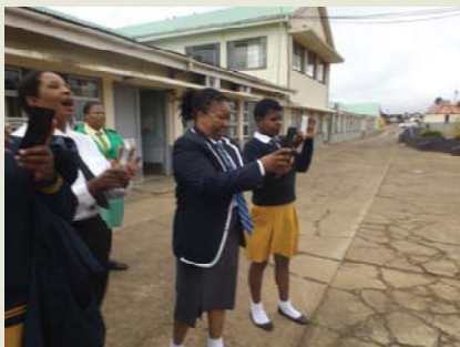
Above: everybody were corporate by showing some talents like singing encouraging songs.