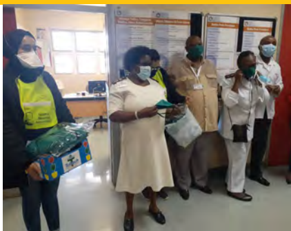
DONATION OF CLOTHES FACE MASKS....