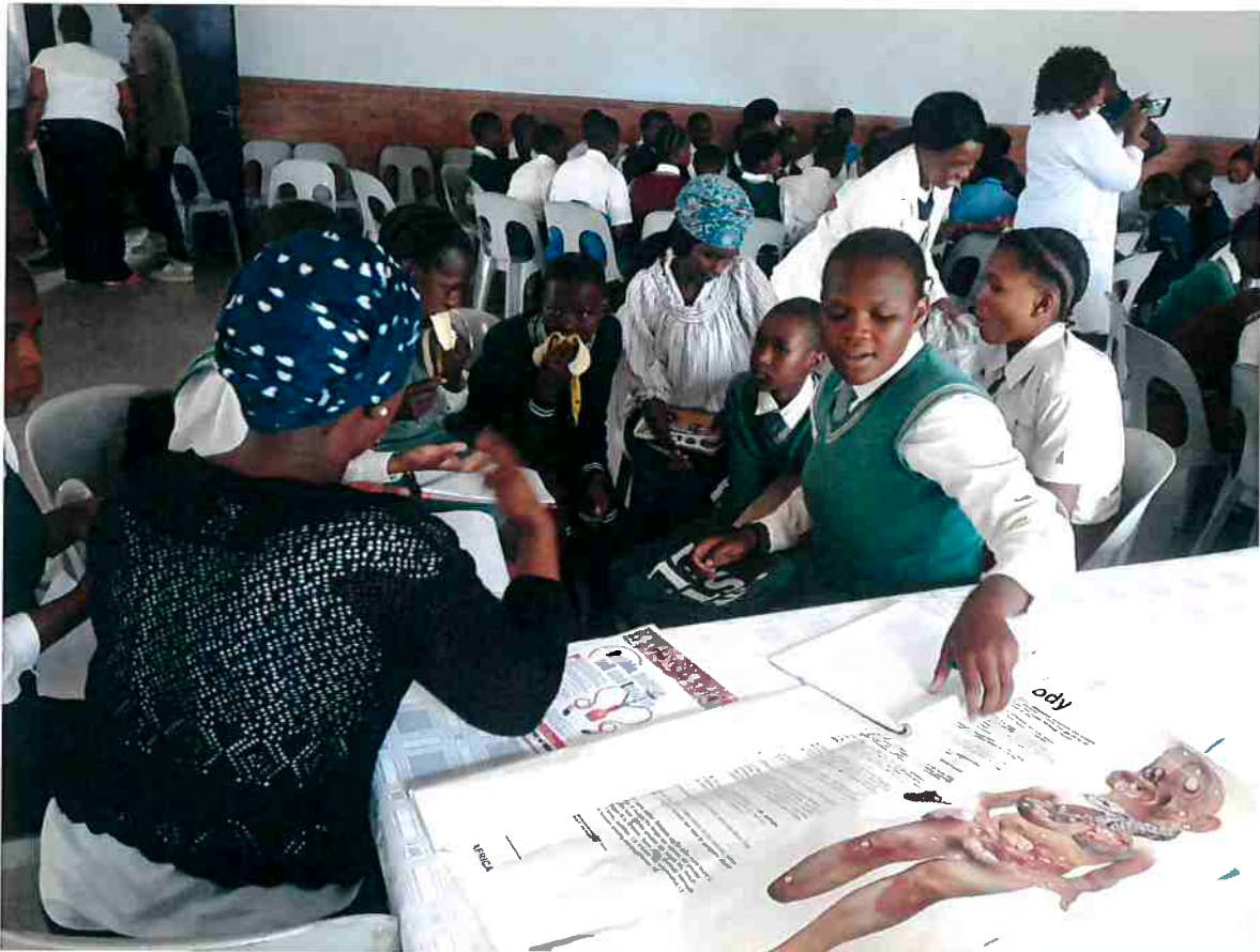
Attendees during group discussions

On the 24 th January 2019, UThukela Health District heeded to a call to roll out the “She Conquers” National Campaign. Campaign is aimed at empowering young women and adolescent girls to stay safe in terms of decreasing teenage pregnancy, decreasing sexual and gender based violence abuse; creating economic development, decreasing new HIV infection and taking young girls to school for them to be dependent not rely to sugar daddies.