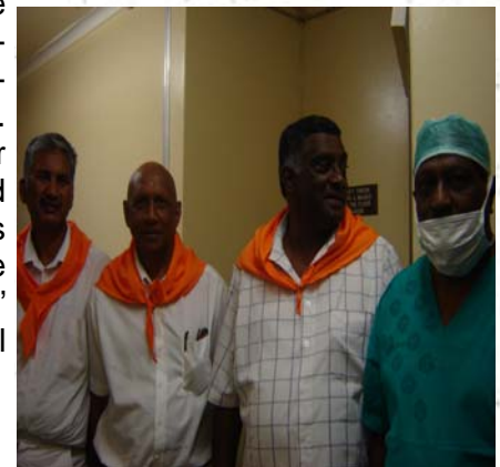
Members of the Sathya Sai Sudha Foundation