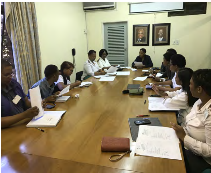
Audit team– Analyzing the tools