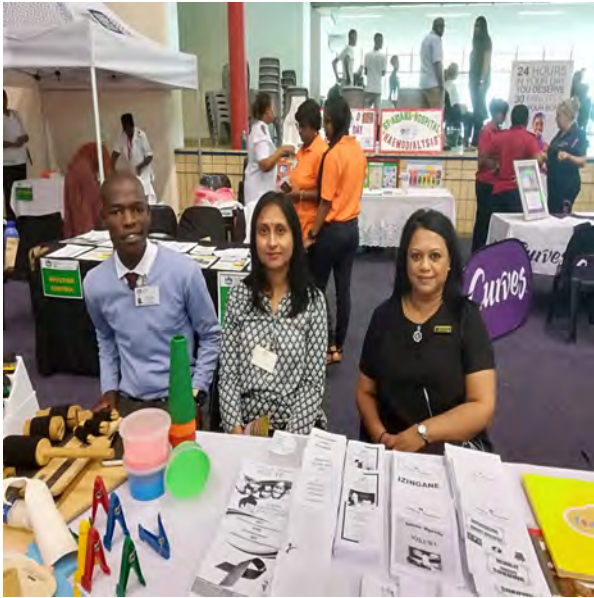
Social Work Team