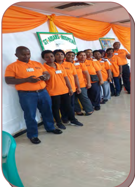
Staff Members attending the World TB Day event