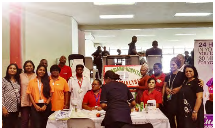
St. Aidan's Team