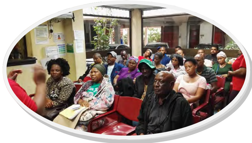
Audience listening to the presentation on the Importance of Kidney Care