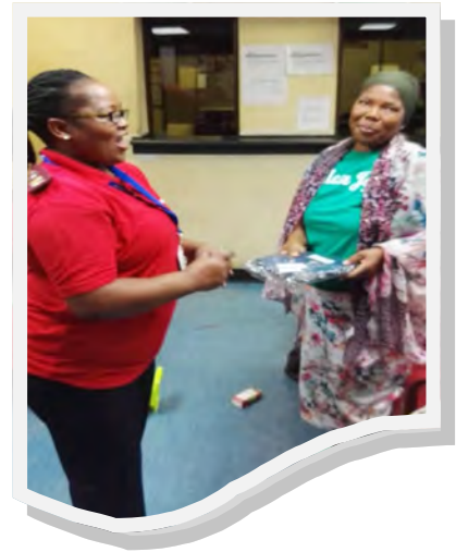
One of the patients receiving a prize