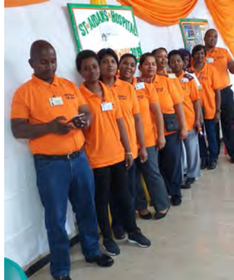
WORLD TB DAY READ MORE ON PAGE 03