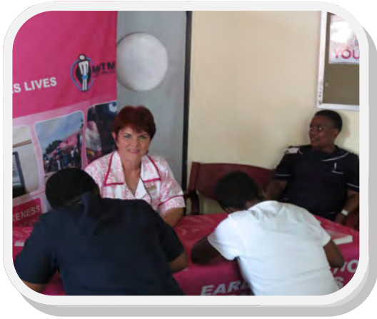
Staff members registering for breast examination