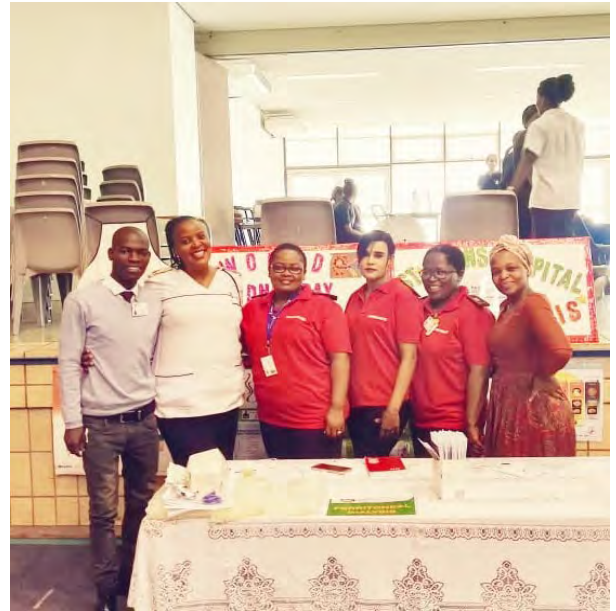
HD and PD Team