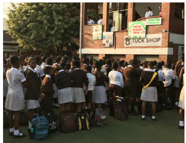
St Anthony's Visit by St Aidan's IPC