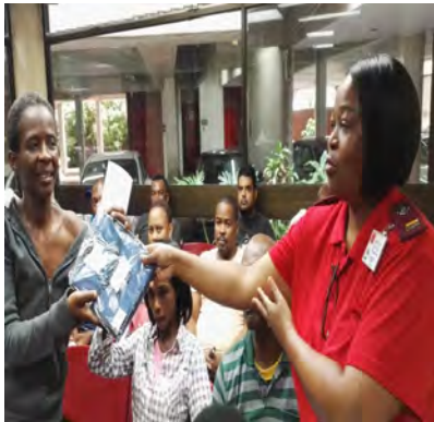
WORLD KIDNEY DAY... READ MORE ON PAGE 2