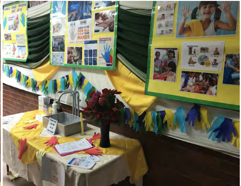
Haemodialysis Ward Hand Washing Display