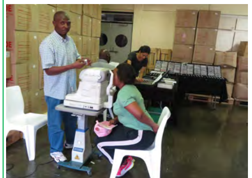
WORLD HEALTH DAY READ MORE ON PAGE 04