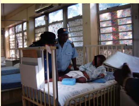
Members from SAPS Durban Central who came visit our Paediatric Ward

International Children's Day was commemorated on 1st June 2009. St Aidans Mission Regional Hospital highlighted issues pertaining to child abuse, neglect, HIV/AIDS, child protection and care of children by having a poster presentation. Pamphlets and brochures were distributed within the hospital to staff and patients. On 11 June 2009 the social work department undertook a presentation on child abuse and the New Children's Act of 2005. During this month the SAPS from Durban Central visited our Pediatric Ward and brought with them toys, books and educational material for our children. The SAPS gave an informative talk on their role in the community, in relation to child protection, thus creating awareness on issues such as abuse.