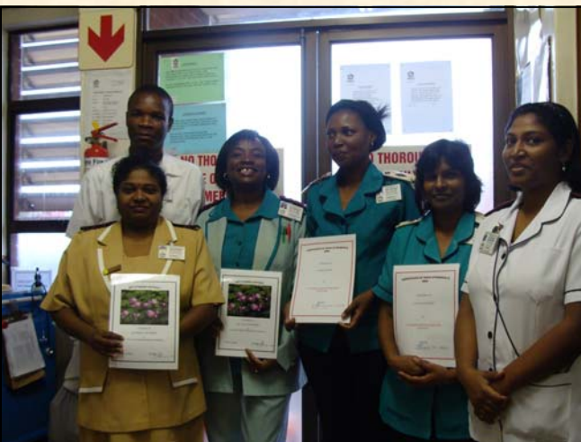
Urology Staff took a picture after receiving their certificate.