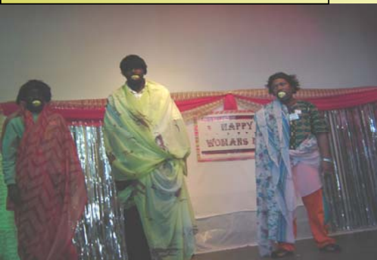
3 Males dress in Saris . Don't they look good?