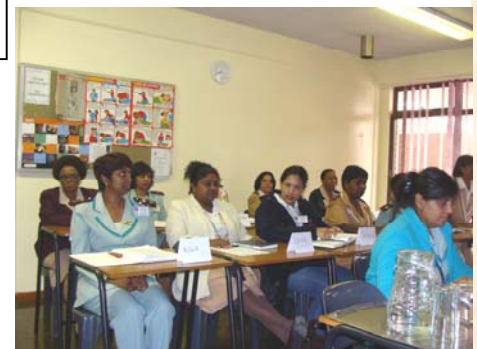
Candidates listening attentively to the facilitator.

institution and promised to start doing things which will help in improving service delivery of the institution.