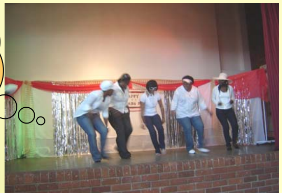
Dance by the eye clinic staff