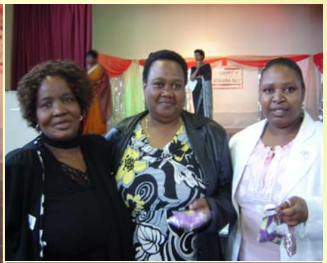
Ladies were well dressed