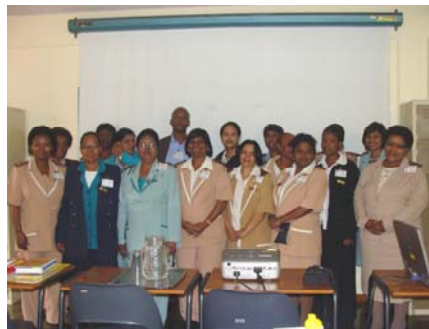
A picture of all attendees

We targeted Batho Pele ambassador in order for them to cascade the information to their different departments. On the first day we concentrated on the Implementation of Batho Pele in the work place , Origin, Vision and Mission of Batho Pele. Ambassadors had a chance to voice their views on the organisational culture of the institution and its impact on service delivery.