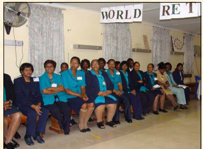
Attendees of the event.