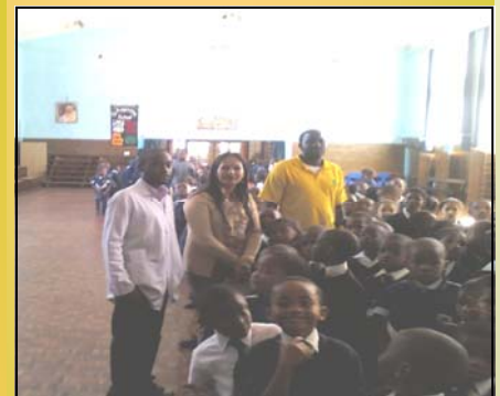
The Pharmacy team also visiting St Augustins Primary School

use of paraffin. There was a positive response from the public & various schools. We as Pharmacy staff are hoping that our efforts were well appreciated and the theme was well depicted.