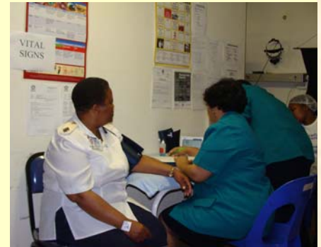
A Staff member getting her blood pressure checked.

We hope that those staff members who were diagnosed with any condition are taking necessary steps to ensure the safety of their health and we will support them in any way possible.