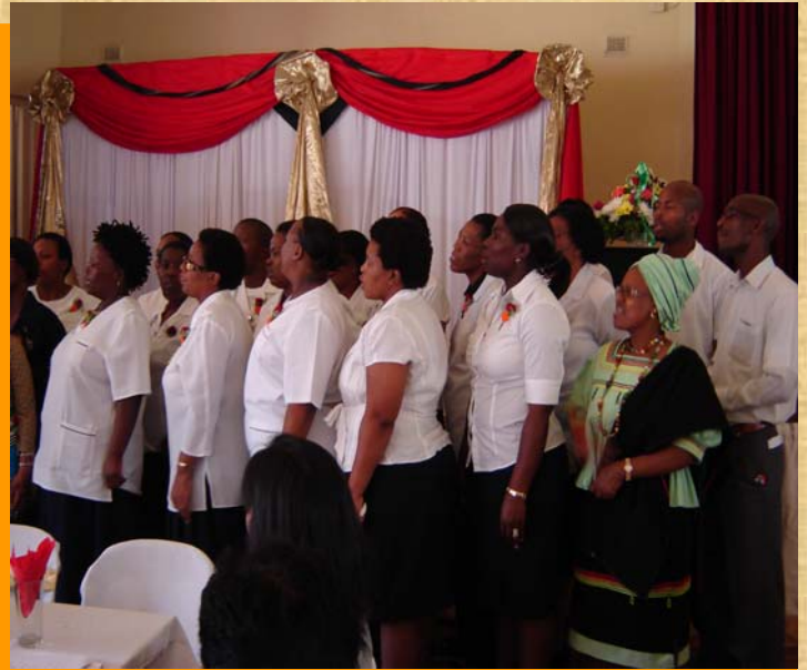
ST AIDANS HOSPITAL CHOIR KEPT OUR ATTENDEES ENTERTAINED BY SINGING