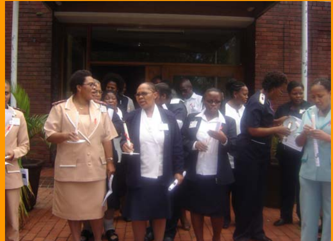
STAFF MEMBERS LIGHTING CANDLES IN COMMEMORATION OF THOSE AFFECTED AND INFECTED BY HIV/AIDS