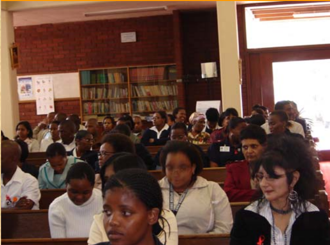
STAFF MEMBERS WHO CAME IN THEIR REMARKABLE NUMBER TO ATTEND THE HIV/AIDS AWARENESS PROGRAMME