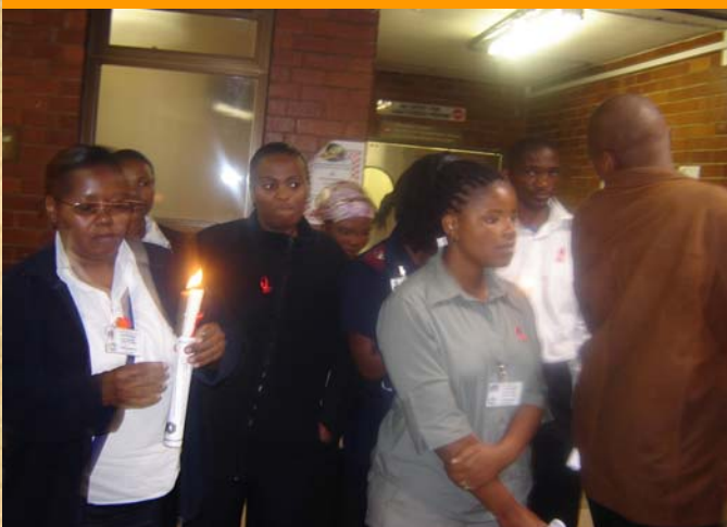
STAFF MEMBERS PROCEEDING TO THE WARDS TO PRAY WITH PATIENTS.