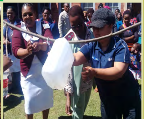
Handwashing-Tippy tap at Gateway SAH