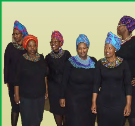
SAH scooped two trophies at Ugu Health District Choral Competition.