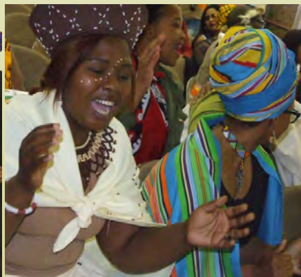
SAH attended Ugu Health District Heritage