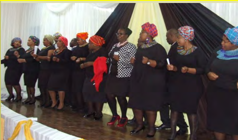
St Andrews Choir Group singing their master pieces.