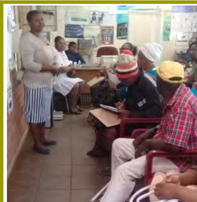
PAGE 3.. Mental health