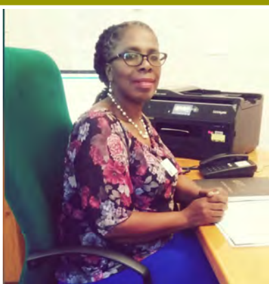
PAGE .. 2 CEO's corner