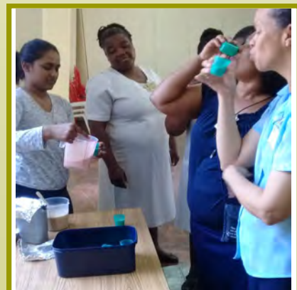
PAGE 4.. Healthy breakfast tips