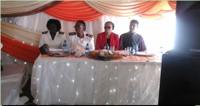
The hospital Management