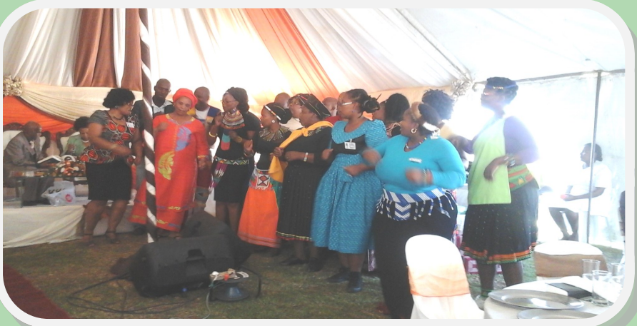
The St. Andrews hospital choir