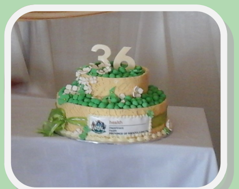
36 years of service