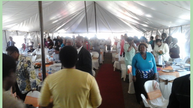
The staff attended in numbers