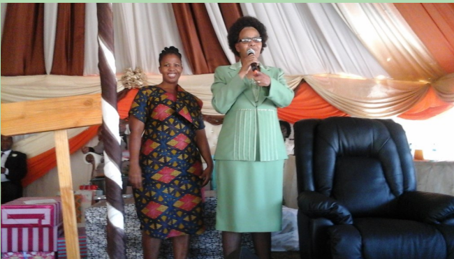
The CEO and her daughter