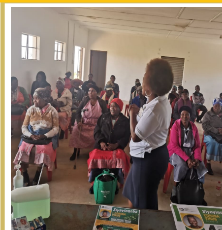
St Andrews hospital Management and the Mayor of Umuziwabantu during the COVID –19 outreach at the post office pay point.