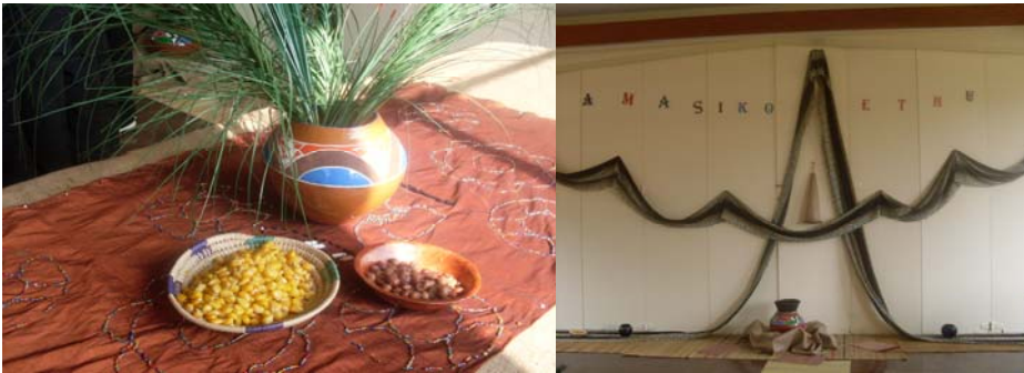
Kwakuhotshiswe kahle kanje ngalolusuku ehholo lesibhedlela