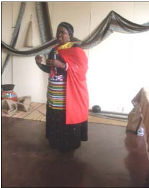
UNkk Gasa ethula inkulumo yakhe eyayishubile engokuziphatha komuntu wesifazane.