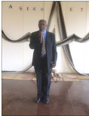
UMnuz Z. Ndaleneni oyilungu lebhodi yesibhedlela ethula inkulumo yakhe ngokuziphatha kwezinsizwa