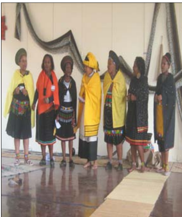
Amalungu ekomidi leWellness eculela abasebenzi ngomgubho wamasiko. Hhayi kwakushubile