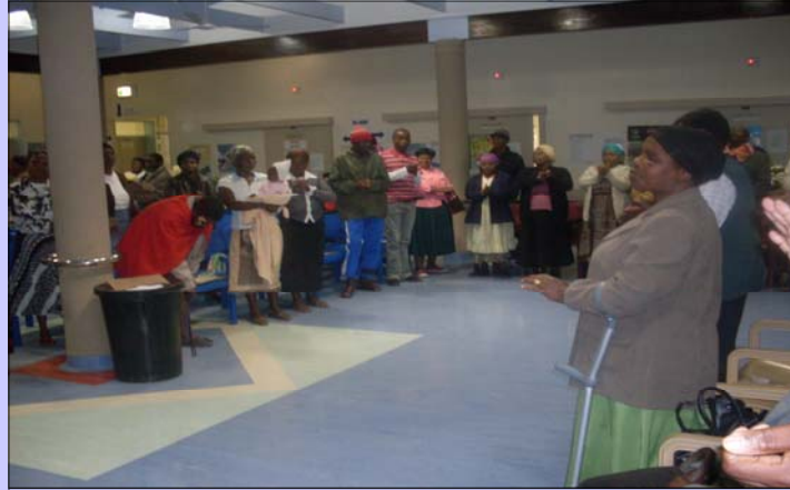
Community members singing a song just before Swine Flu educational talks started

The month of September was busy for our Outpatient Department as they had educational talks on Swine Flu every Monday in September. The main aim behind the talks was to let the community more aware about the symptoms and preventative measures of this disease.