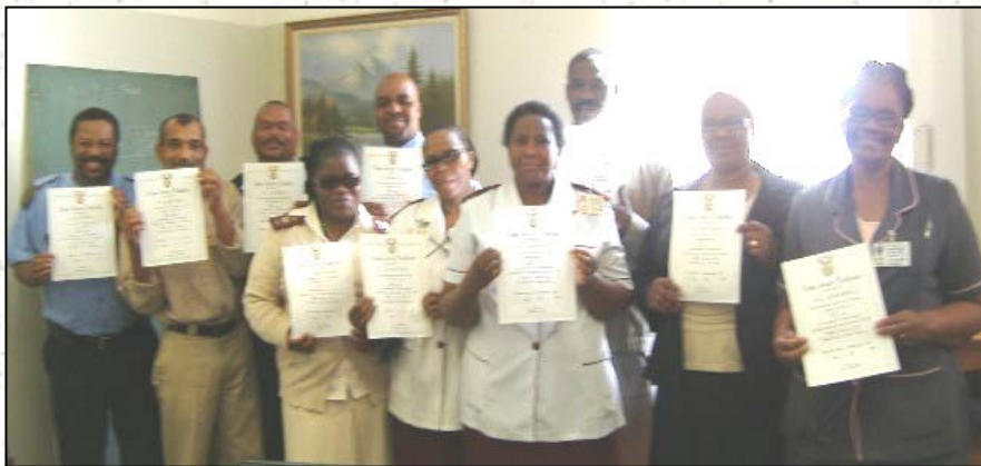
Above: all the employees that were awarded for serving the public for 20 years.

The St Andrews Hospital's Human Resources department hosted an awarding ceremony for employees that have served the health department for 20 years.