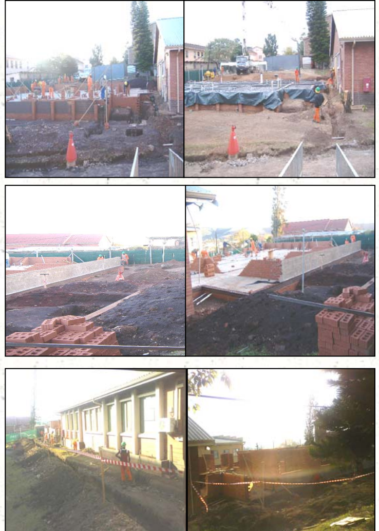
Above: The progress of the construction of the new SDU. Currently the foundation has been completed and the slab has been cast.

The construction of the SDU is also expected to help the hospital to combat cases of septic wounds at the operating theatre, already these cases seldom occur therefore this will be a way of promoting primary health care with cleanliness and hygiene.