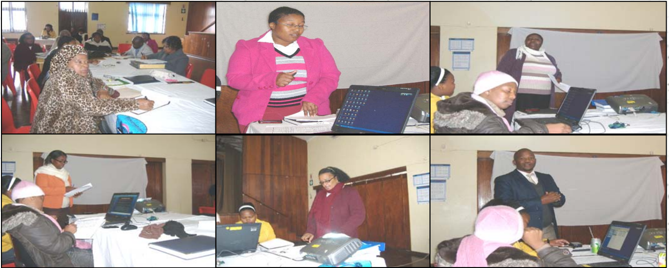
Above: Supervisors from different departments presenting their department's challenges, achievements and their way forward

O n the 27th of May 2011, St Andrews Hospital hosted their Strategic Plan meeting in which different government institutions, traditional healers and six Amakhosi were invited to have an input in the Strategic Plan.