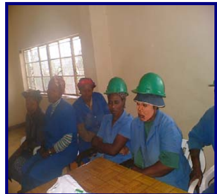
Harding Treated Timbers employees