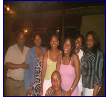
Hospital staff outside Ingeli Forest Lodge