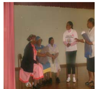
Abasebenzi basegumbini lokebelethisa abantu iskeshi

Umdlavuzwa wesibeletho kwaba eminye yemidlavuzwa akhuluma ngayo waphinde wagquguzela abantu besifazane ukuba bazijwayeze ukuhlola izibeletho zabo (pap smear).