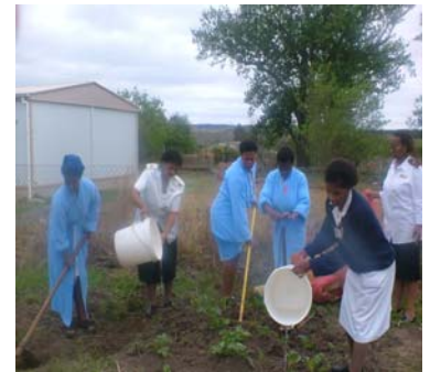
Paediatric ward staff working at the garden with border mothers.

These mothers also share the knowledge they have gained from this project with their families and neighbours and this has increased the love of gardening to the community.