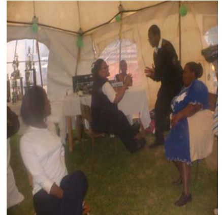
St Andrews staff doing a play on Batho Pele which kept everyone in stitches