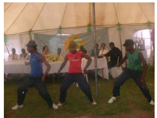
A dance group called Three Boyz wowed the crowd with stunning dance moves