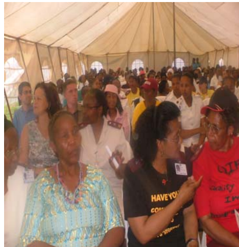
The tent was packed with guests!!!