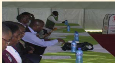
Sundumbili CHC Management and other high dignitaries

This event was a huge success as community members went back home with accurate and appropriate information about HIV and AIDS and they were ready to take action and make a difference of their lives by getting tested for HIV and AIDS and take their ARV treatment appropriately.