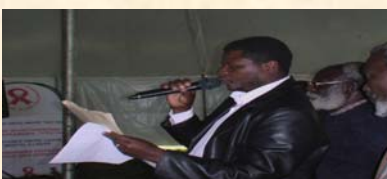
Imbongi (a praise singer) welcoming