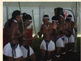
Izintombi zomchayo entertaining the crowd with their cultural