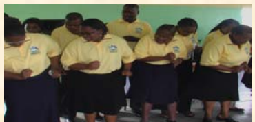
Sundumbili CHC Choir stole the audience's attention with their remarkable performance