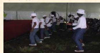
Local kids entertaining the audience with their kwaito dance