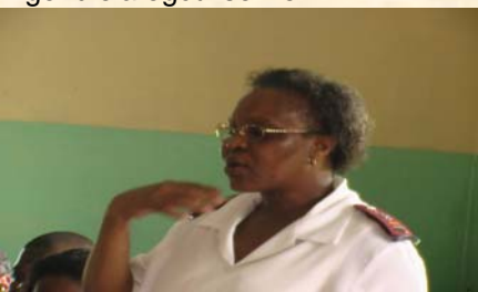
Unkk. Sindane inhloko yamakliniki ephendula imibuzo yomphakathi

Lomcimbi wahamba kahle kakhulu ngoba umphakathi wazuza ulwazi olukhulu ngesifo sikashukela futhi waze wabuza nemibuzo mayelana nalesisifo nezikhulu zaseSundumbili zabaphendula ngendlela egculisekile.