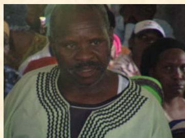
ilunga lomphakathi libuza izikhulu imibuzo mayelana nesifo sikashukela