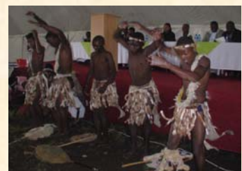
Abafana bendlamu stole the show with their outstanding performance