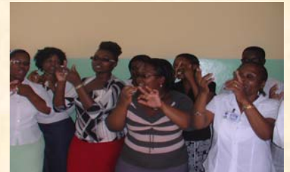
Ikhwaya yaseSundumbili ishukumisa inkundla