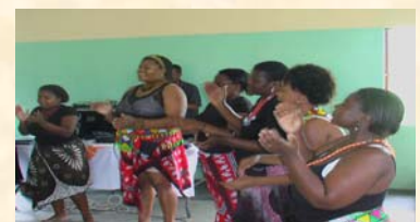
The crowd was also entertained by Sundumbili CHC indlamu