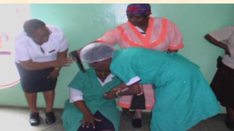
umdlalo ofundisa umphakathi ngesifo sikashukela