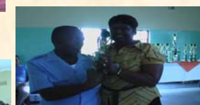
best in mobile clinic award— Mr.