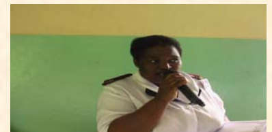
Usista Zuma osebenzela ngaphansi kohlelo lokulashwa kwezifo ethula inhloso yalolusuku