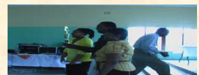
Best organized department - VCT