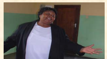
Unkk. Shabalala onesifo sikashukela eluleka umphakathi ngokubaluleka kokudla okunempilo