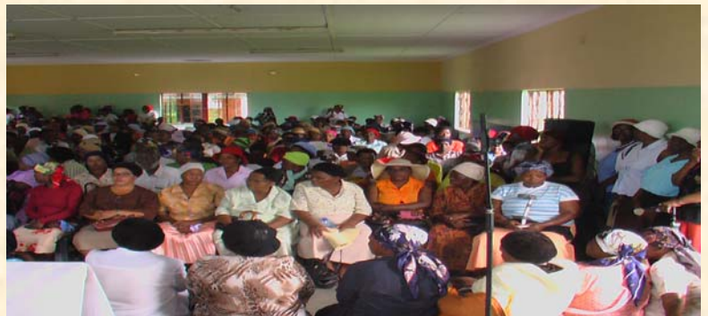
Umphakathi wawubuthene ngobuningi bawo ukuzothola ulwazi mayelana nezindlela zokunqanda isifo sikashukela.