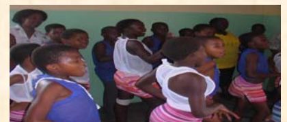
Izingane zasembewenhle zazi-jabulisa ngomculo nangomdanso wazo