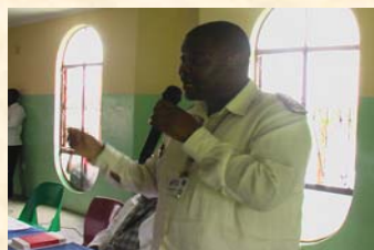
Umnuz. Sangweni isekela lomphathi wabahlengikazi efundisa ezihlewe ngezimpawu zesifo sikashukela kanye nokubaluleka kokuhlola lesisifo