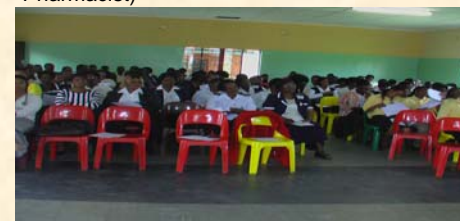
The staff was present to witness this prestigious event