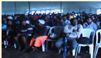
The audience paying careful attention to the proceedings of the day