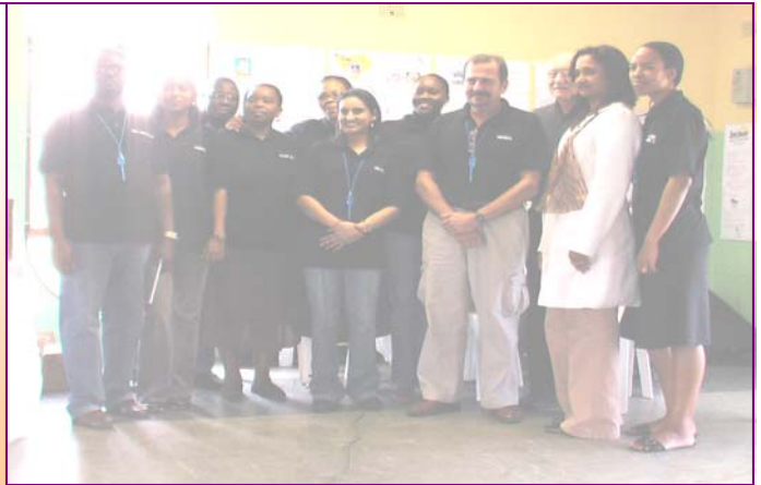
Pharmacy staff posing for the picture during the Pharmacy Awareness Event

This campaign was sponsored by ARK which is an NGO operating within Sundumbili CHC which specializes in HIV/AIDS epidemic and related issues.