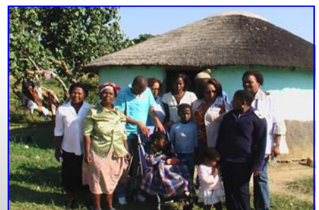
Ithimba lihlola isimo sesiguli esasimukelise isihlalo sabantu abangakwazi ukuzihambela (wheelchair)