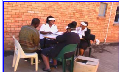
Nurses serving a patient during the Madiba Day at Sundumbili Plaza

Sundumbili CHC really made a huge positive impact to the lives of many people during this day as this was also an initiative of Madiba to fight the spread of HIV/ Aids in order to build a healthy nation as he has 46664 programme to look after those who are infected /affected by HIV/Aids epidemic.